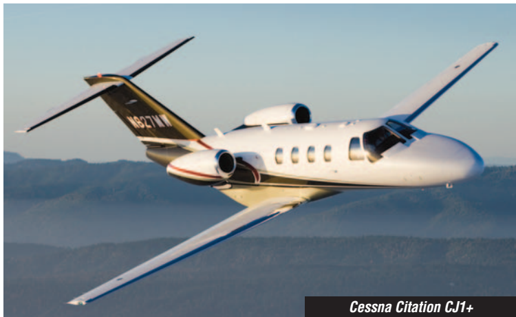
Cessna Citation CJ1+

spending time after delivery with a customer or deploying a “shop-in-a-box” equipped with tools and spares to a site to support one or multiple customers.