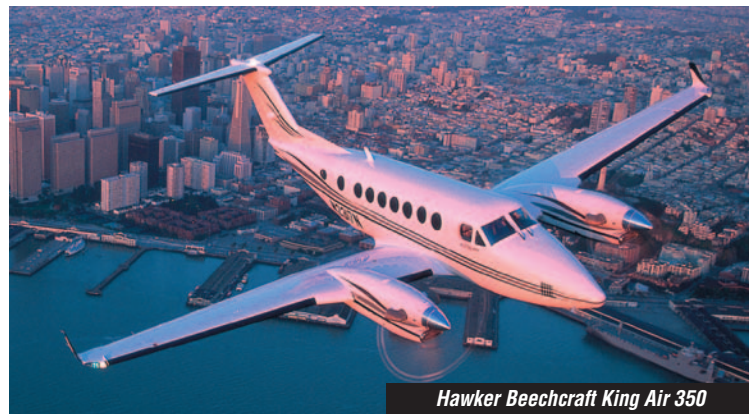
Hawker Beechcraft King Air 350

In January, HBC consolidated all of its customer support functional groups under the new Hawker Beechcraft Global Customer Support entity. This incorporates four groups: Support Plus; Hawker Beechcraft parts and distribution; Hawker Beechcraft Services; and product support. HBC also established cross-functional teams to help make sure projects get done in five key areas, including AOG response; international support expansion; parts availability, cost